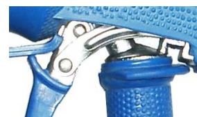
Rubber collar for better protection