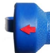
Red arrow for beam direction

*** Although all materials used can withstand temperatures up to over 100° C, it is strongly recommended to take special precautions when using hot water.