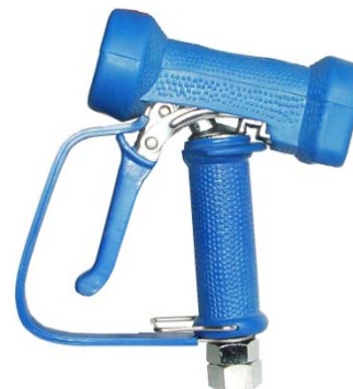
AKRNP01-B-SWR09-3/4 With ball bearing Stainless Steel swivel 3/4" female

All bold printed items are ex. Stock available